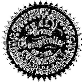
Comptroller of the Currency